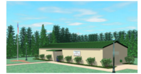
Physical Fitness Center