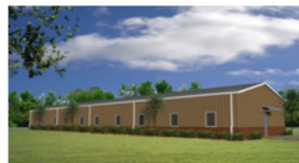
Billeting - S/R SH/B