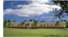
Multiple Bunk Billeting