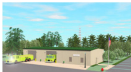
Fire Hall Maintenance