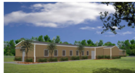
Multiple Bunk Billeting Alt