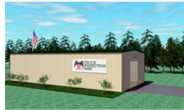
Truck Inspection Canopy