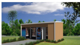
Vending & Public Telephone