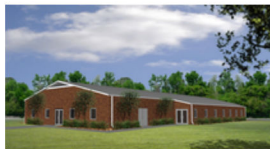
Training Device & Simulation