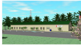
Troop Medical Center