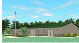
Billeting - S/R S/B